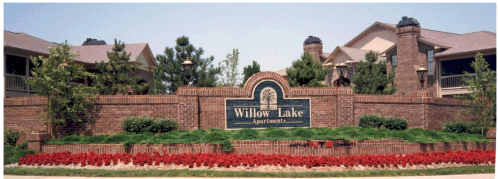
Example of a Sign Located on Fence or Wall on Either Side of a Driveway