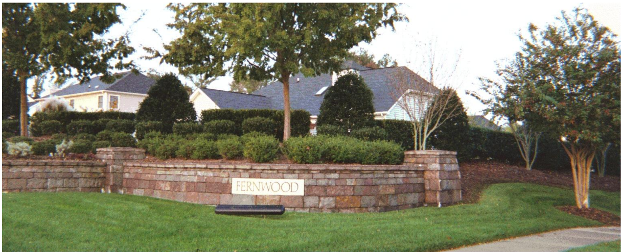
Single Faced Sign on One Side of an Entrance Street