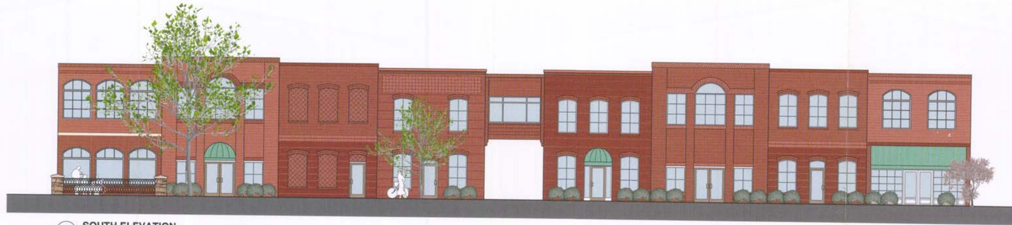
1 SOUTH ELEVATION SCALE: 1/8" = 1'-0"