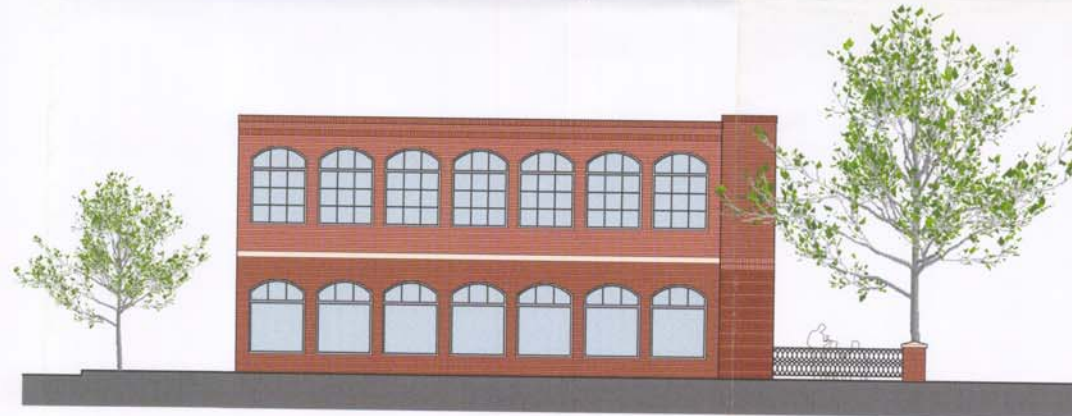
3 WEST ELEVATION SCALE: 1/8" = 1'-0"

VARIOUS SHADES OF RED BRICK CANVAS AWNINGS