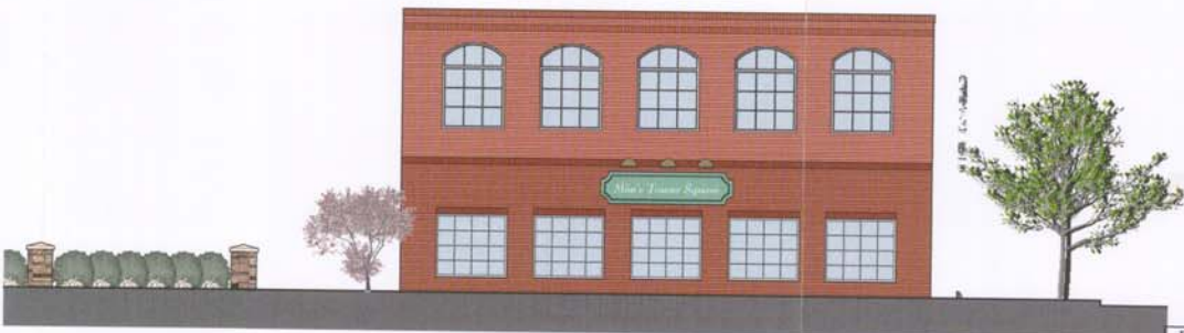
4 EAST ELEVATION SCALE: 1/8" = 1'-0"