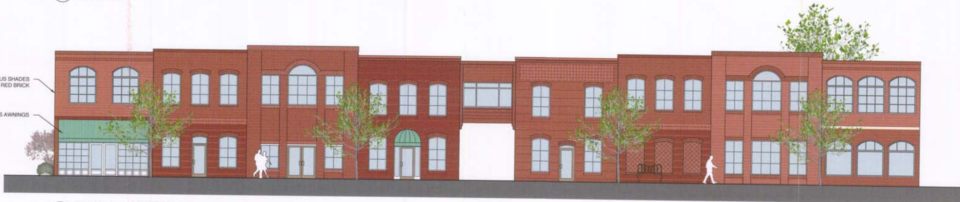
2 NORTH ELEVATION SCALE: 1/8" = 1'-0"

VARIOUS SHADES OF RED BRICK CANVAS AWNINGS