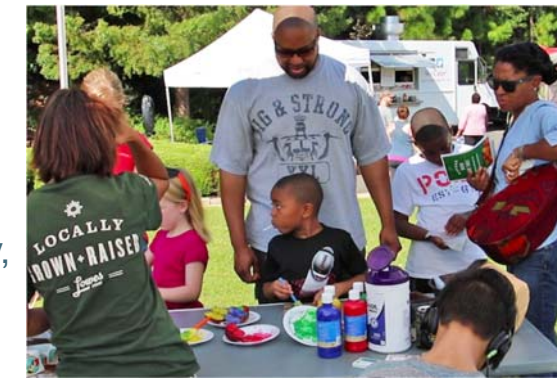
Face painting, live animals, a band, crafts, food, vendors from the community, plus the usual boat rentals and fishing.