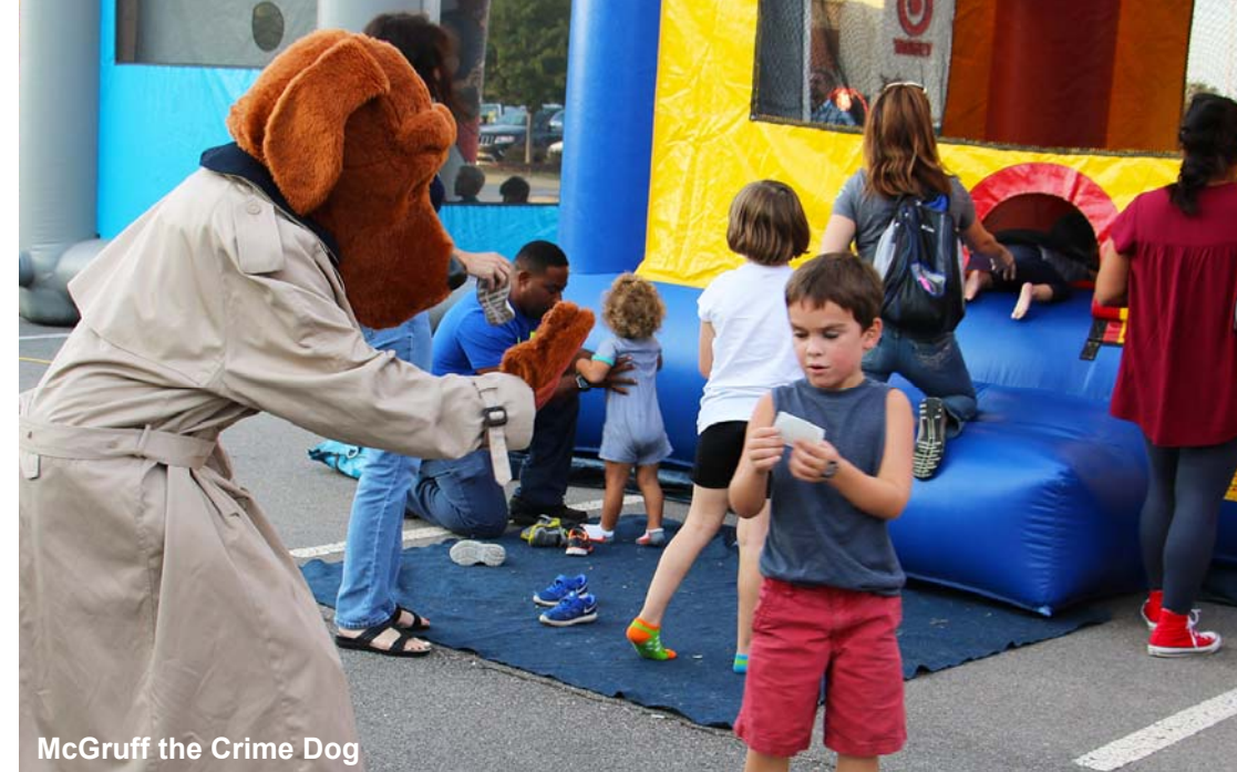
McGruff the Crime Dog

Food: Mr. Softee Ice Cream and other food trucks